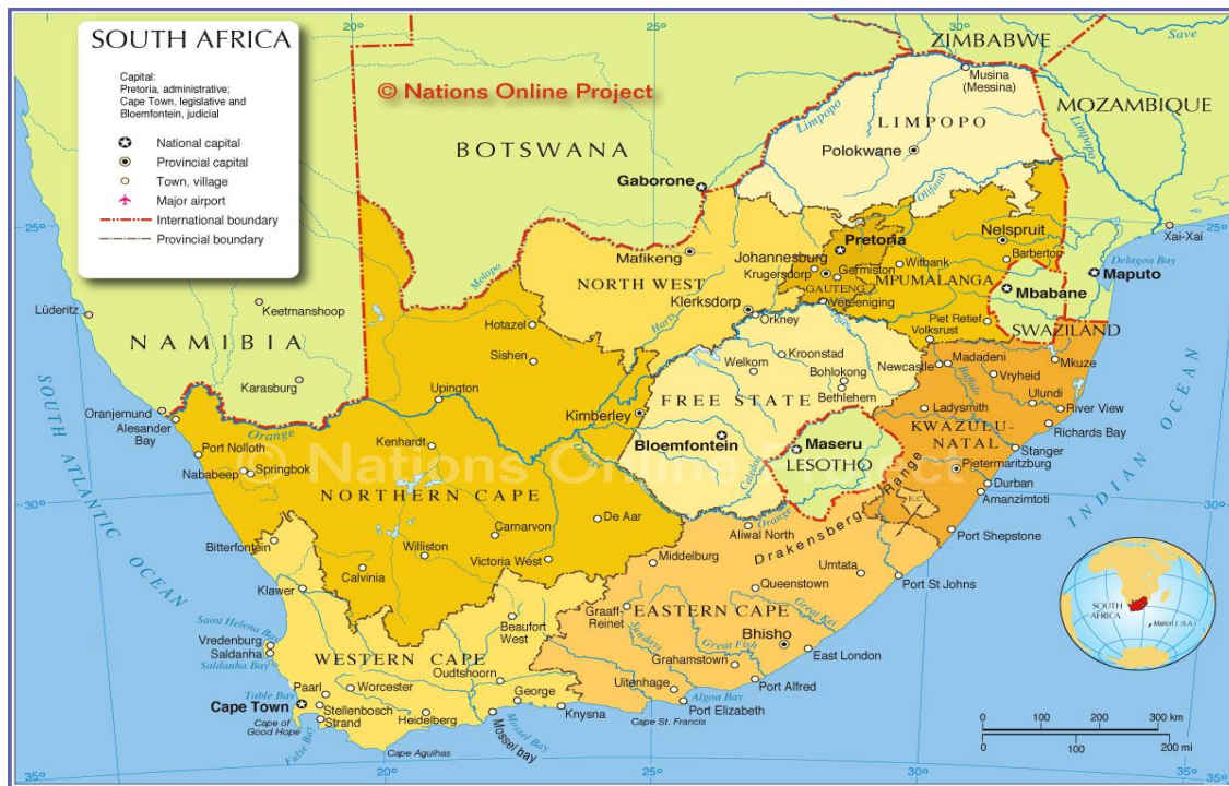
Figure 1. A map showing the approximate geographical area of South Africa where the rural community in Limpopo Province is located. The area is indicated in light pink in the northern tip of the country (Statistics South Africa, 2011)

The study was conducted in Limpopo Province, South Africa. (See the light pink coloured area in the map). Limpopo Province is comprised of urban communities (that is, cities and towns) managed by local government, and rural communities (that is, informal settlement or villages) managed by traditional leaders (chiefs). The rural communities are in a geographic area located outside towns and cities in Limpopo Province. As the custodians of tradition and cultures of people in rural areas, traditional leaders are the rightful leaders of their own constituencies, which are communities in their area of jurisdiction. Limpopo is one of the poorest regions of South Africa with a big gap between poor and rich residents, especially in rural communities. The province is divided into five district municipalities, namely Capricorn district, Mopani district, Sekhukhune, Vhembe and Waterberg district municipality.