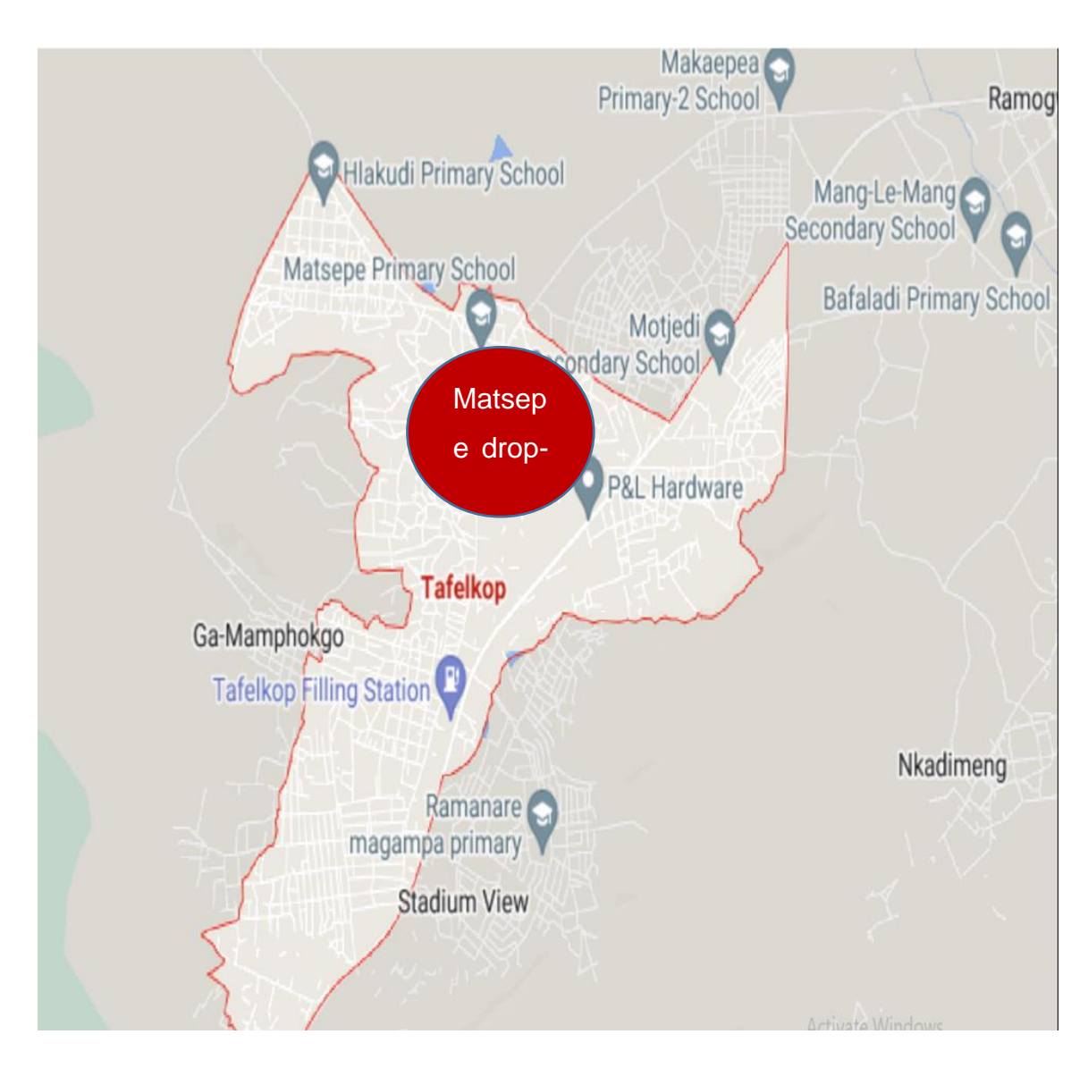
Figure 1: Map of Tafelkop indicating Matsepe Drop-in Centre which will be used in the study.

Source : https://www.map.tafelkop.gov.za (11/09/2015)