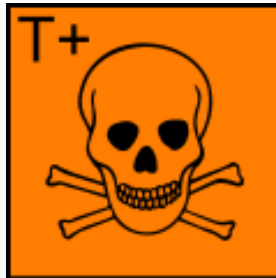
Very toxic (T+)