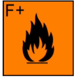
Extremely flammable (F+)