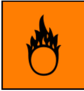
Oxidizing agent (O)