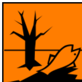
Dangerous for the environment (N)