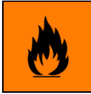
Highly flammable (F)